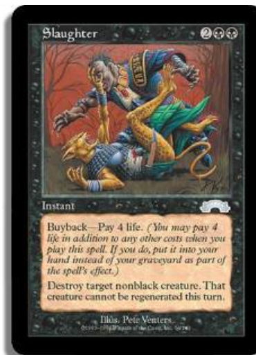
Slaughter shows him killing Mirri, Cat Warrior soon after becoming a vampire.