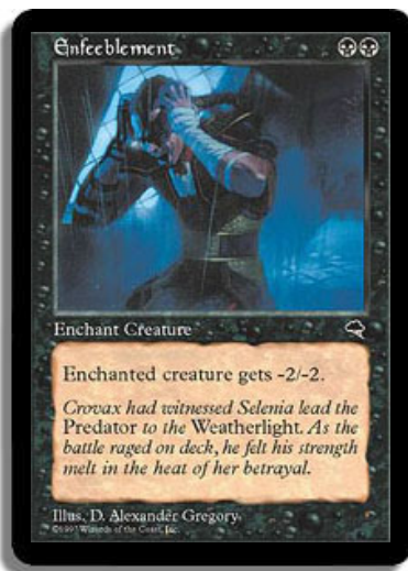
Enfeeblement shows Crovax despairing over his betrayal by Selenia, Dark Angel.